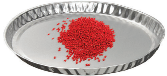
Aluminum Weighing Dish